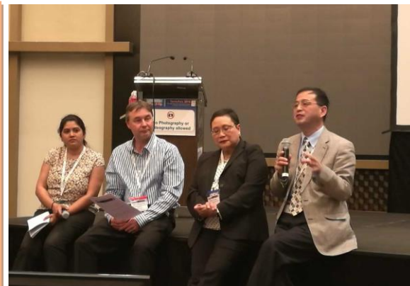
FOP WORKSHOP Q&A SESSION